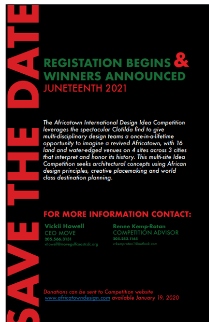
Original competition invite/ postcard. Dates to be re-scheduled for Juneteenth 2021.